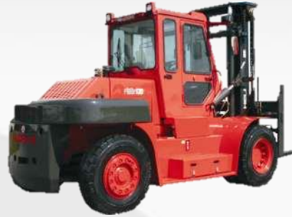
Pneumatic Forklifts 3000 – 36,000# Capacity