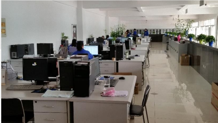
Global Parts Headquarters