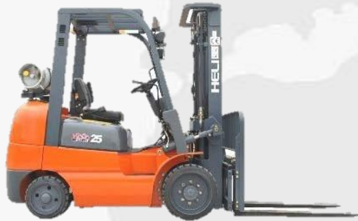
Warehouse Forklifts 4000 – 6000# Capacity