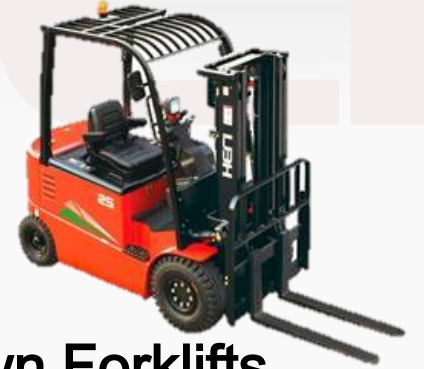
Electric Sit-Down Forklifts 3000 – 8000# Capacity