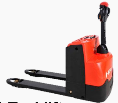
Walk-Behind Forklifts 3000 – 4500# Capacity